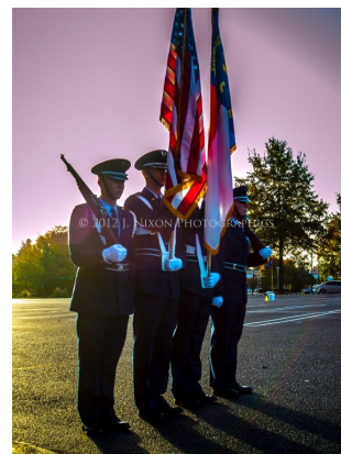
Drill Comp. Honor Guard

competed to see which Flight was the best. The GMC took over the Wing, showed the POC what they were made of, and together we led yet another highly successful 49er Drill Competition. The AS100s were introduced to a new IMT program, and FTP was revamped. When the results of the Detachment Inspection came in, we rose to the challenge and proved our flexibility. Together, we grew as a Detachment and are one step closer to those shiny butter bars!